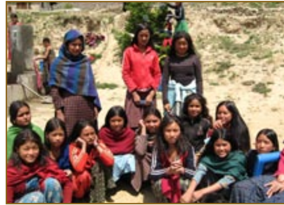
Girl's Hostel in Simikot

One of the groups we have started working with is a girl's hostel in Simikot, the district town of Humla. This hostel provides an opportunity for girls from all parts of the district to receive a secondary education. As there are only three secondary schools in a district that takes 10+ days to walk from north to south, many people live 3-4 days walk from a secondary school. This hostel accommodates 30 girls, mainly from poor and low-caste families, and some with physical disabilities. However, the government only gives them c. euro 10 per month, which is not sufficient for their food and educational supplies. We are building a demonstration vegetable farm where people in other parts of the district can see state-of-the-art vegetable growing with greenhouses and irrigation. The girls can sell any surplus in the local market and use the funds to support the running costs of the hostel.