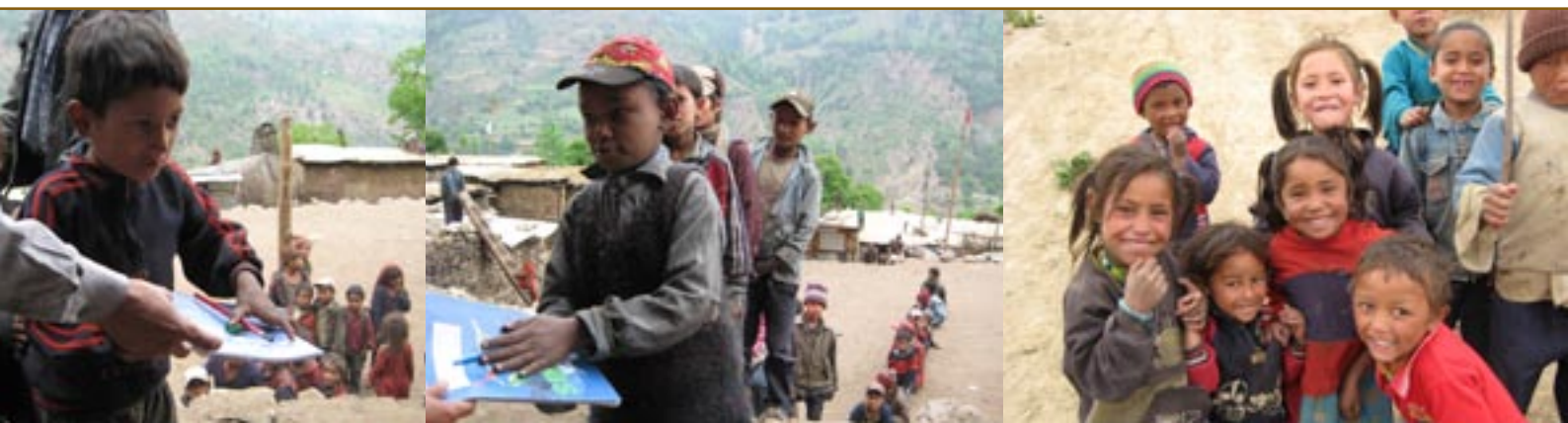
Children Queuing for Educational Materials