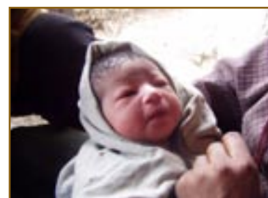
New Baby in Maila