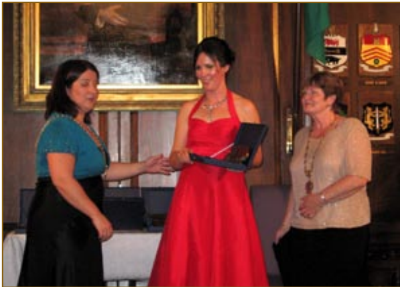
Outstanding Young Person of the Year Award in the Humanitarian Leadership Category