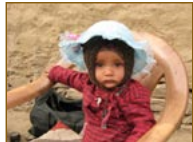
Joining the Queue for Copies and Pencils

Mother education is also key, as where the mothers are literate and value education, they are more likely to keep their children in school. Our income generation projects also include adult literacy training, so that mothers have less financial pressure to take the children out of school and put them into child labour, whilst giving them a better education and ability to help their children with homework etc.